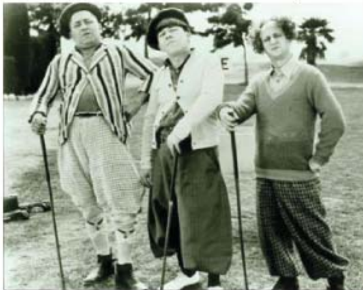
PROCEEDS TO BENEFIT THE AIA/NEI SCHOLARSHIP PROGRAM

Register before June 15th and enjoy an early bird discount of up to 20%!